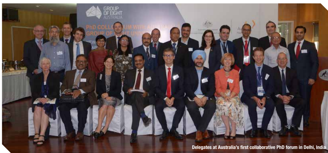
Delegates at Australia's first collaborative PhD forum in Delhi, India